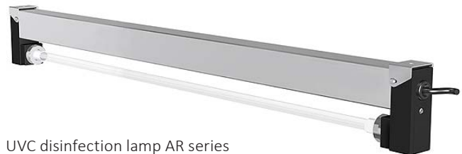
UVC disinfection lamp AR series