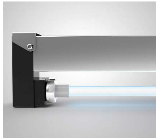
UVC disinfection lamp AR-300-1500 with mounting set