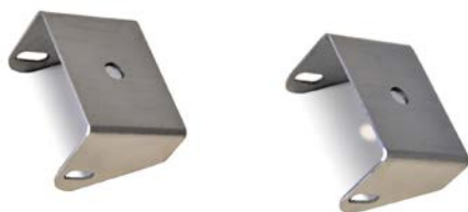
Standard mounting set (inclusive)

The standard mounting kit with two brackets for screwing is included.