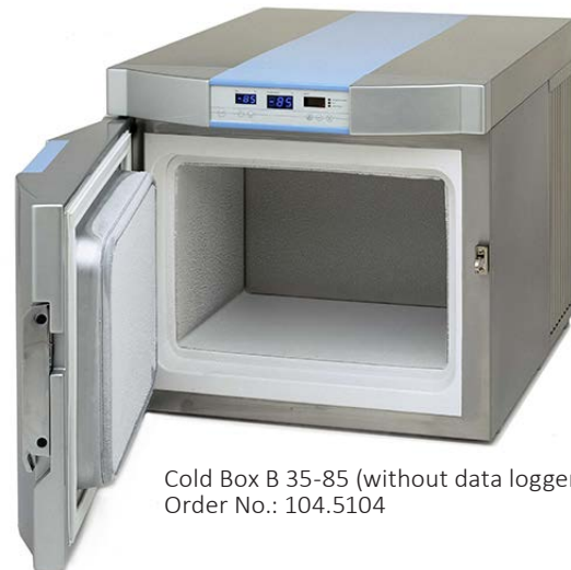
Cold Box B 35-85 (without data logger) Order No.: 104.5104