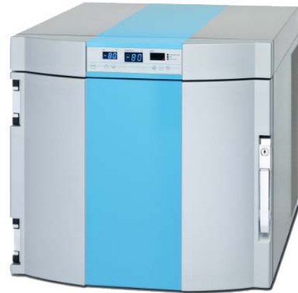
Cold Box B 35-85 (without data logger) Order No.: 104.5104