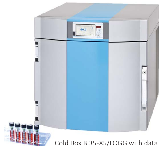
Cold Box B 35-85/LOGG with data logger (option)