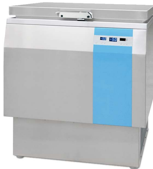
Tiefkühltruhe TT 50-90