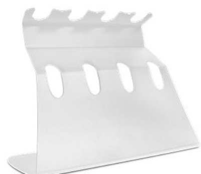
4-position stand for 4 pipettes.