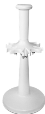
Carousel stand (rotating) for 6 pipettes