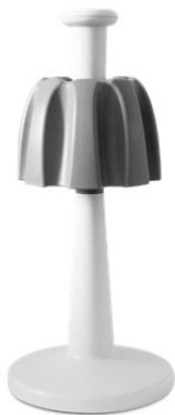
Multiple stand (fixed) for 8 pipettes