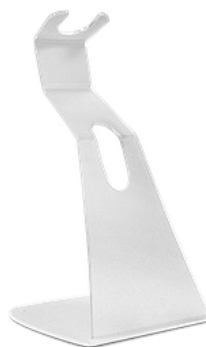
1-position stand for 1 pipette.