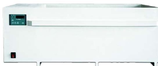
Water bath MKWB 150