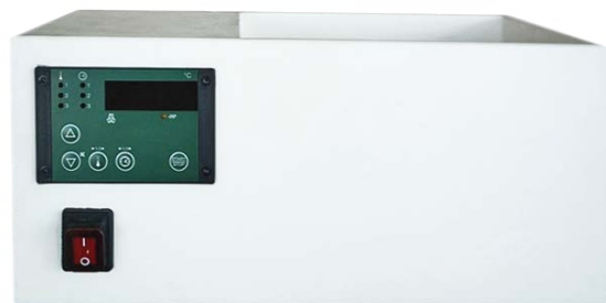
Water bath MKWB 5