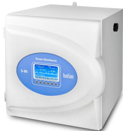
CO 2 Incubator Smart