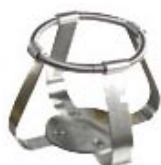
HSC-50, HSC-100, HSC-250, HSC-500, HSC-1000

Clamps for platform UP-168 for flasks with 50 ml - Ø 50 mm 100 ml - Ø 65 mm 250 ml - Ø 85 mm 500 ml - Ø 105 mm 1000 ml - Ø 130 mm