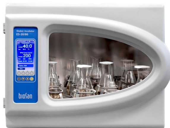
ES-20/80 with platform HSP-16/250