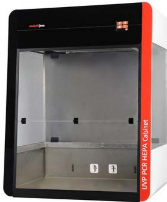
UV PCR Cabinet / HEPA