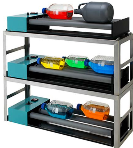
Optional stacking shelf for several devices